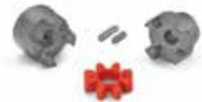
Flex Coupler Series