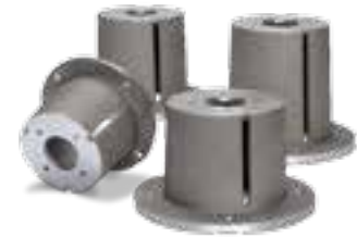
Bell Housing Series